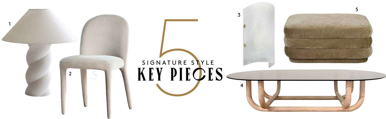
1 'Twister' lamp base, $2200, Sophie Davies. 2 'Onasis' dining chair, $399, Domayne. 3 CTO Lighting 'Whistler' wall light in Satin Brass, $3325, Winnings. 4 'Lark' coffee table, $5980, Fanuli. 5 'Kennedy' ribbed large square ottoman in Silver Sage, $1410, GlobeWest.